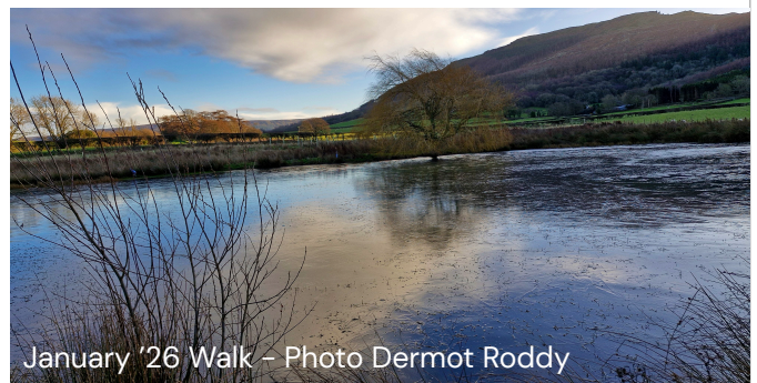
January '26 Walk – Photo Dermot Roddy