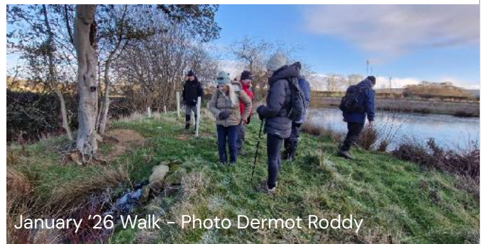
January '26 Walk