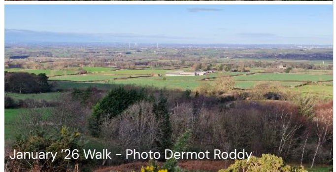
January '26 Walk