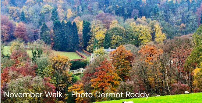
November Walk