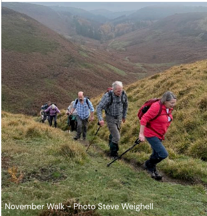
November Walk

1. Charles I; 2. USA; 3. General Strike; 4. Sir David Attenborough; 5. Winnie the Pooh