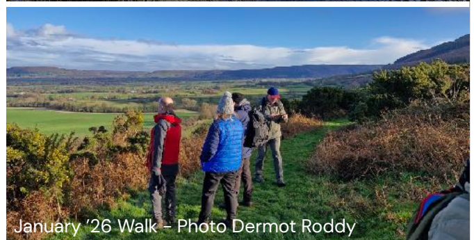
January '26 Walk