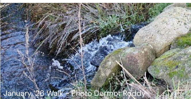
January '26 Walk – Photo Dermot Roddy