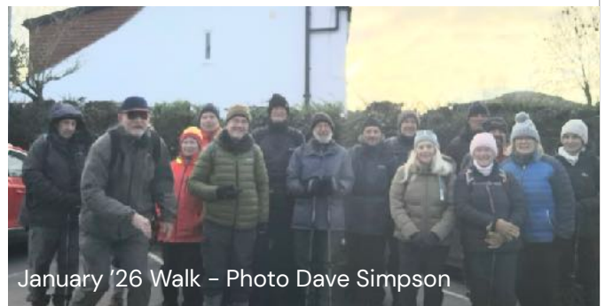
January '26 Walk