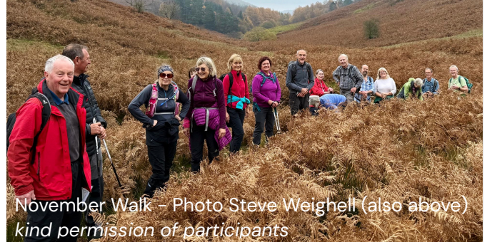
November Walk

Vale of York. We then travelled back east towards Arden Hall, Coomb Hill House, Nag's Head Wood and back to Hawnbly Church. It was great to have some new members joining us on this occasion, swelling our numbers on the walk to 17.