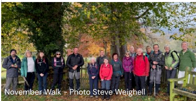
November Walk – Photo Steve Weighell